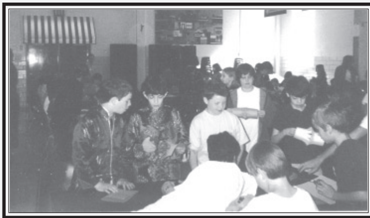
Role Playing games involve students in social situations, learning to interact while practicing alternate points of view. In this photo students at a neighborhood school share a live action roleplaying game set in China.

This game and its board covers western Europe and clash of forces along the coast of France and the Allied drive into Germany. A great deal rides on players' initial assumptions about their opponents plans and initial setup. A miscalculation along the Atlantic Wall can affect the rest of the game. The rules are relatively short and quick to learn.