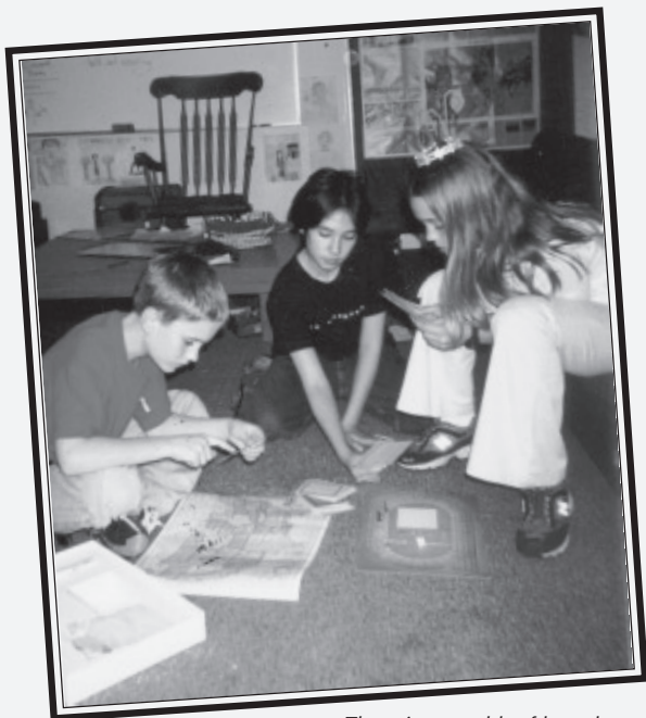
There is a wealth of board games available that are suitable tools for classroom use.

The number one component of this game are the creature cards. Each depicts and describes a species of prehistoric creature in detail. These fact cards themselves can be removed from the game and used in many ways to investigate dinosaurs and their temporal companions. Just playing this game is sure to generate loads