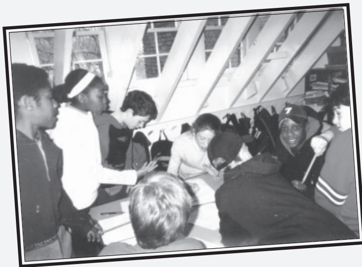
Sixth Grade Diplomats - In the game Diplomacy, the players act as diplomats for their country. Peace, trading, alliances, etc. are negotiated and played out between nations.

Card and dice games are well known in our society and have enjoyed many uses in classrooms for many years. This familiarity allows you to introduce them more easily without having to explain some of the basics, though you may need to reiterate some of them briefly, so everyone agrees on how the role of dealer rotates, for example.